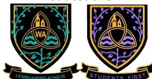
Wigston College – Wigston Academy