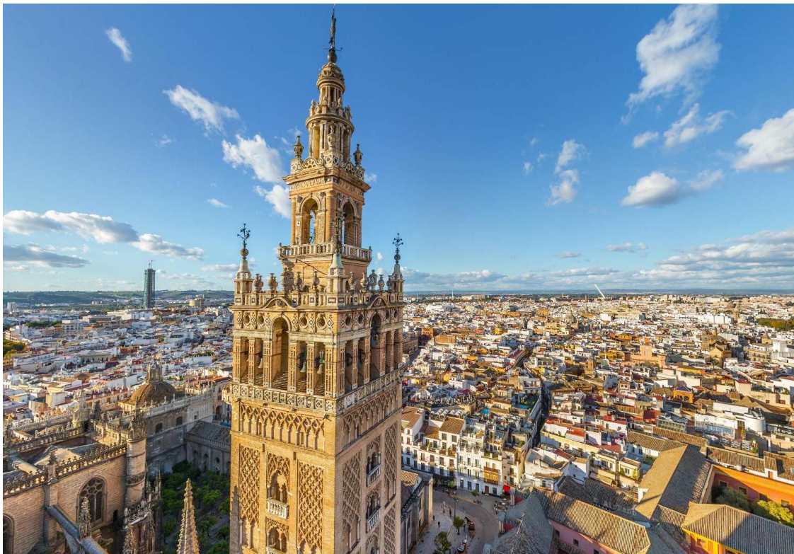
La Giralda - Sevilla